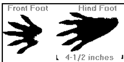
Figure 1. Raccoon paw prints

Raccoons are a grizzled gray in color and are easily distinguished by their bushy tails with alternative black or gray rings, and black mask across their faces. The print of the hind foot faintly resembles that of a small child (Figure 1).