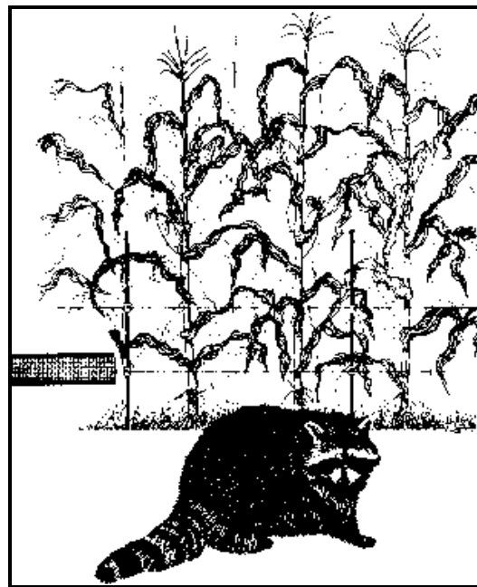
Figure 2. Adding a two-wire fence will help keep raccoons out of field or garden crops. Inset shows the “ribbon-type” electric fence in place of the single-wire type. This ribbon fence is more visible to raccoons and other wildlife and may improve control.

If no other control methods are effective, the problem animals may need to be removed from the area. There are no poisons or fumigants currently registered for raccoon control. Trapping can be effective at removing the problem animals. Leghold (steel-jaw) traps or Coni-bear (body-gripping) traps may be used on rural sites, but should never be used in an urban area because they are non-selecting and there is a risk that a neighbor’s cat, dog, or child might be injured. In