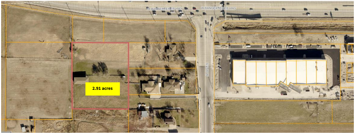
Current Land Use Map